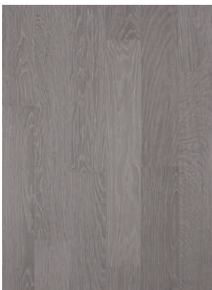
dusky grey stonewash ivory pores oil