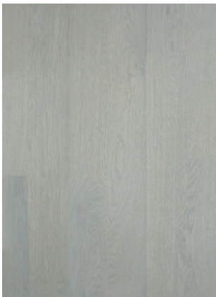
stone grey oil