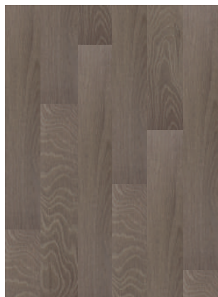
dune stonewash ivory pores oil