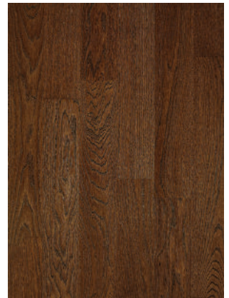
nero brushed oil