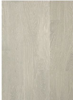
monaco extra matt lacquer