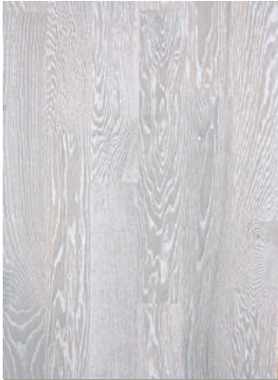
silver moon lacquer