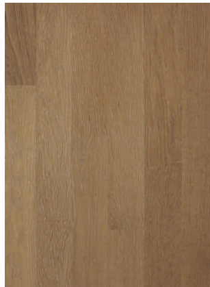
amber stonewash ivory pores oil