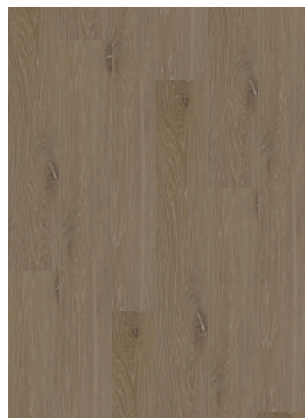
olive stonewash ivory pores oil