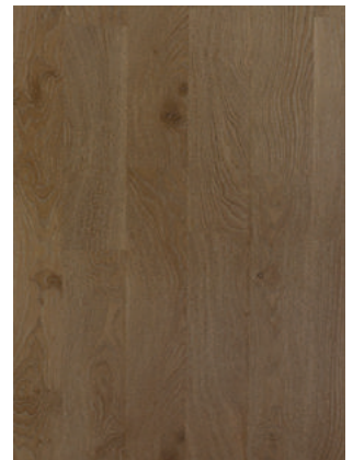
kose grey pores lacquer