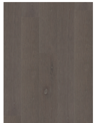
victoria stonewash ivory pores oil