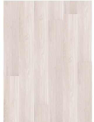
frost ivory pores oil