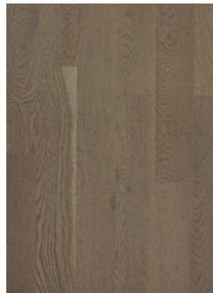
dune brushed extra matt lacquer